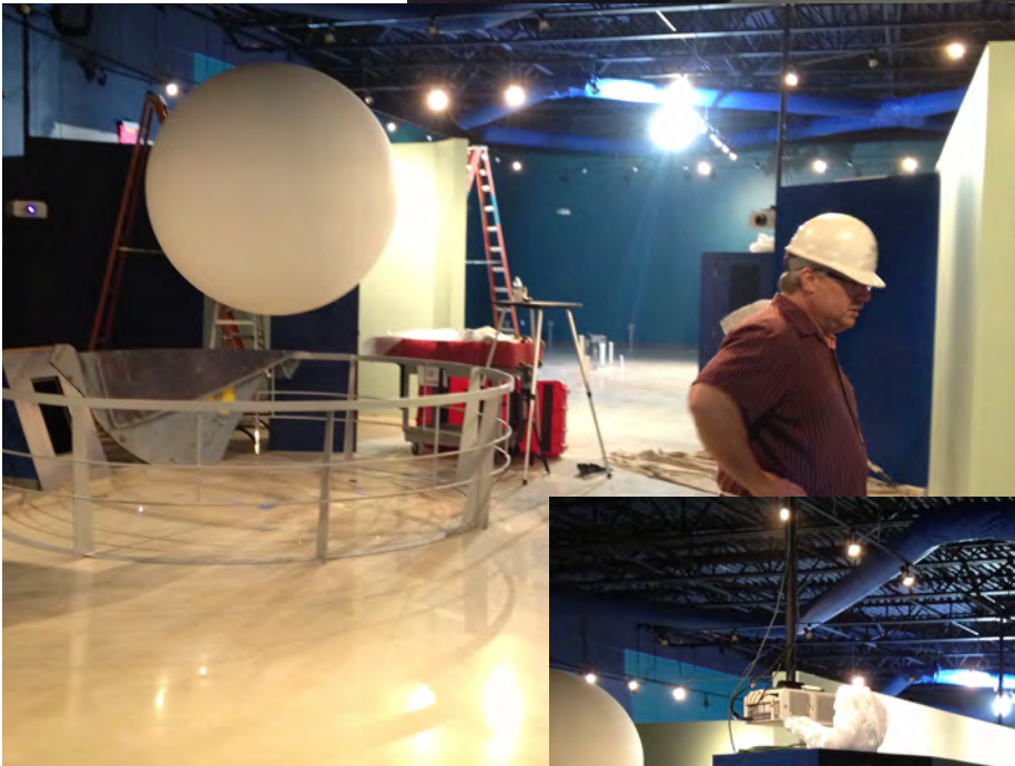
The NOAA crew installed the electronics, the projectors, and the globe after the AST Exhibits installation.